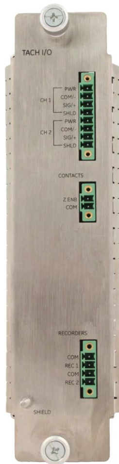
Figure 2: Front view of the Tachometer I/O module

* Denotes a trademark of Bently Nevada, Inc., a wholly owned subsidiary of General Electric Company.