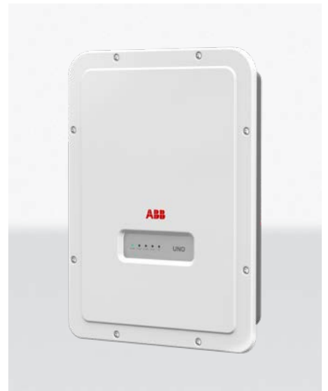
ABB string inverters UNO-DM-TL-PLUS-Q 1.2 to 5.0 kW